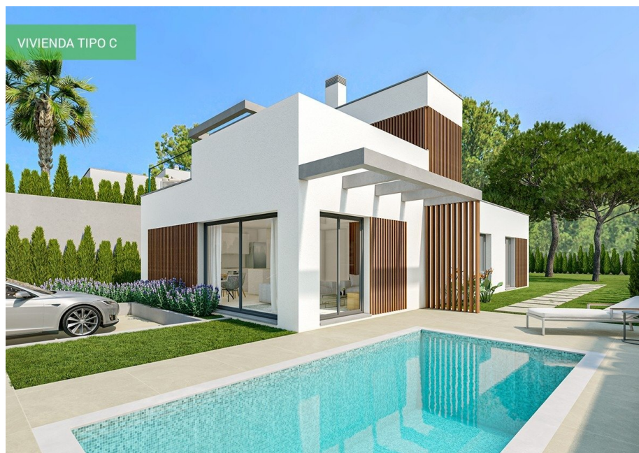
VIVIENDA TIPO C